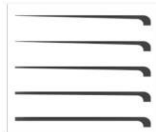
shims for stabilizer 5 x (0° - 0.5° - 1° - 1.5° - 2°)