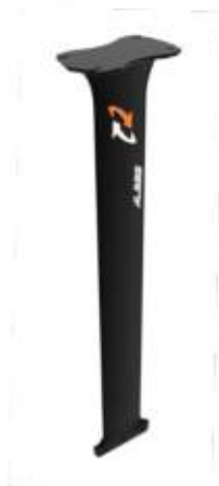
Mast 85 plate